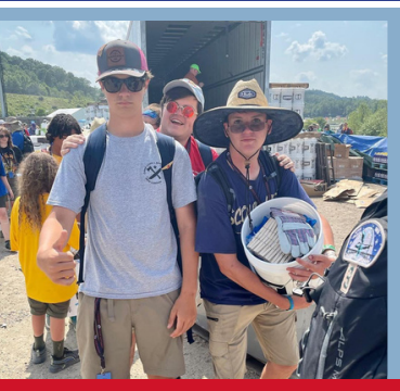
40 Scouts attended National Jamboree at the Summit Betchel Reserve in West Virginia