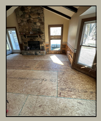
Farm House Renovations