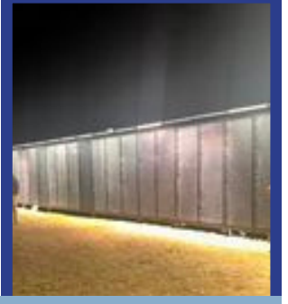
40 Scouts volunteered for the Wall that Heals (a traveling Vietnam War Memorial)