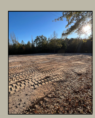
Land Grading for a new parking area