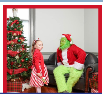
101 individuals attended our 2nd Annual Breakfast with Santa