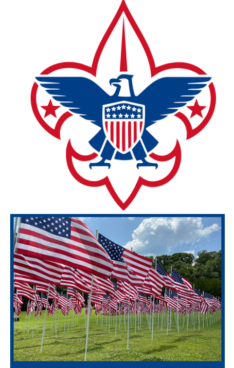
Inaugural Flag for Heroes Event in Duncan Park, City of Spartanburg, SC

Thank you to all of our Scouts, volunteers, donors, and other stakeholders for helping to spread the news of Scouting's great work. We are grateful for the opportunity to serve and impact over 3,800 youth each year. Today is a great day for Scouting, as is every day in the Palmetto Council.