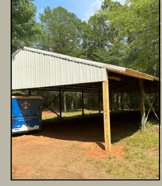
Expanded Pole Barn for Events