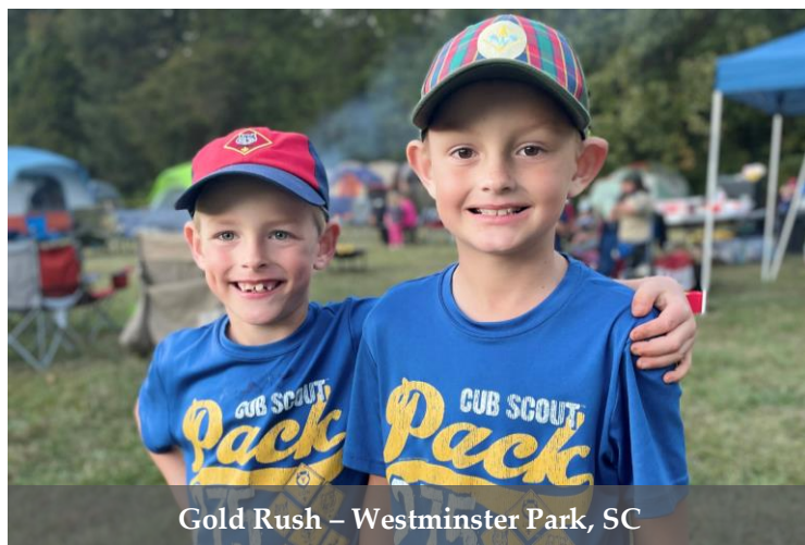
Gold Rush – Westminster Park, SC

Pack 275 leaders feel that every scout should do more camping. We are doing our best to offer a fun and exciting camping experience several times this year.